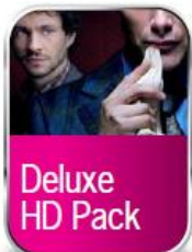
Valid with a 12-month contract

All-time favourites, spectacular documentaries and more